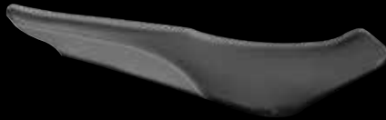
Extra long Seat