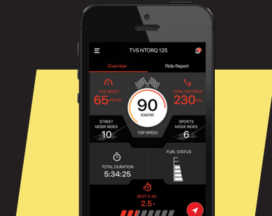
All-new user interface