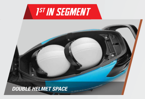
CARRY EVERYTHING YOU NEED AND MORE