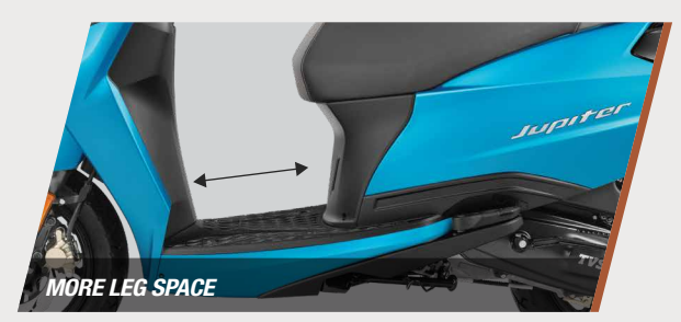
NEVER FALL SHORT ON COMFORT