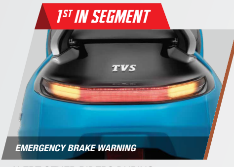
ALERT OTHER RIDERS DURING SUDDEN BRAKE