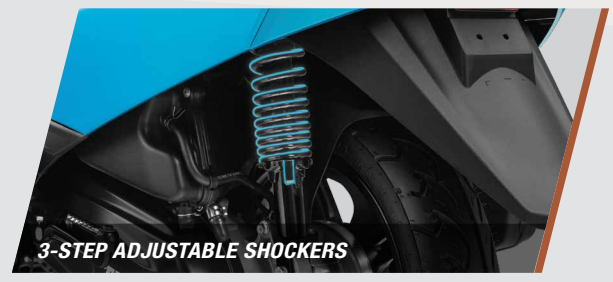
GO THROUGH ROUGH TERRAIN WITH EASE