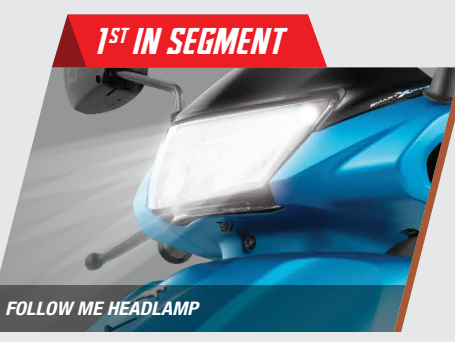
LIGHTS UP YOUR PATH