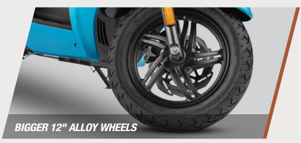
EXPERIENCE SUPERIOR HANDLING AND STABILITY