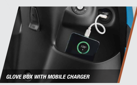
POWER YOUR DEVICES ON THE GO