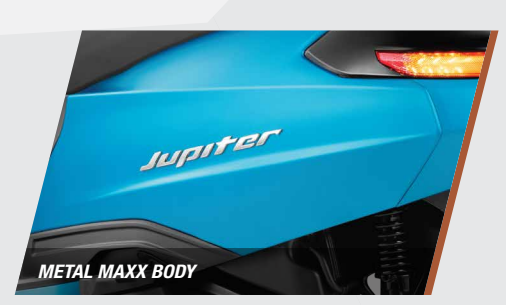
STURDY AND DURABLE BUILD FOR ENHANCED PROTECTION