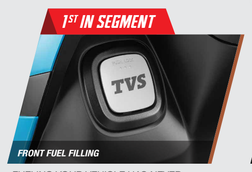
FUELING YOUR VEHICLE HAS NEVER BEEN EASIER