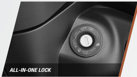
UNLOCK YOUR SEAT AND FUEL TANK WITH A SINGLE KEY