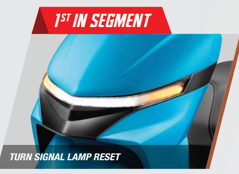
YOUR RIDE MADE SAFER -AUTO OFF INDICATORS