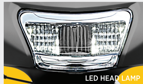
LED HEAD LAMP