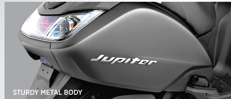
STURDY METAL BODY

The safety features of the new TVS Jupiter are tailored to keep the rider secure irrespective of changing conditions.