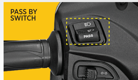
PASS BY SWITCH