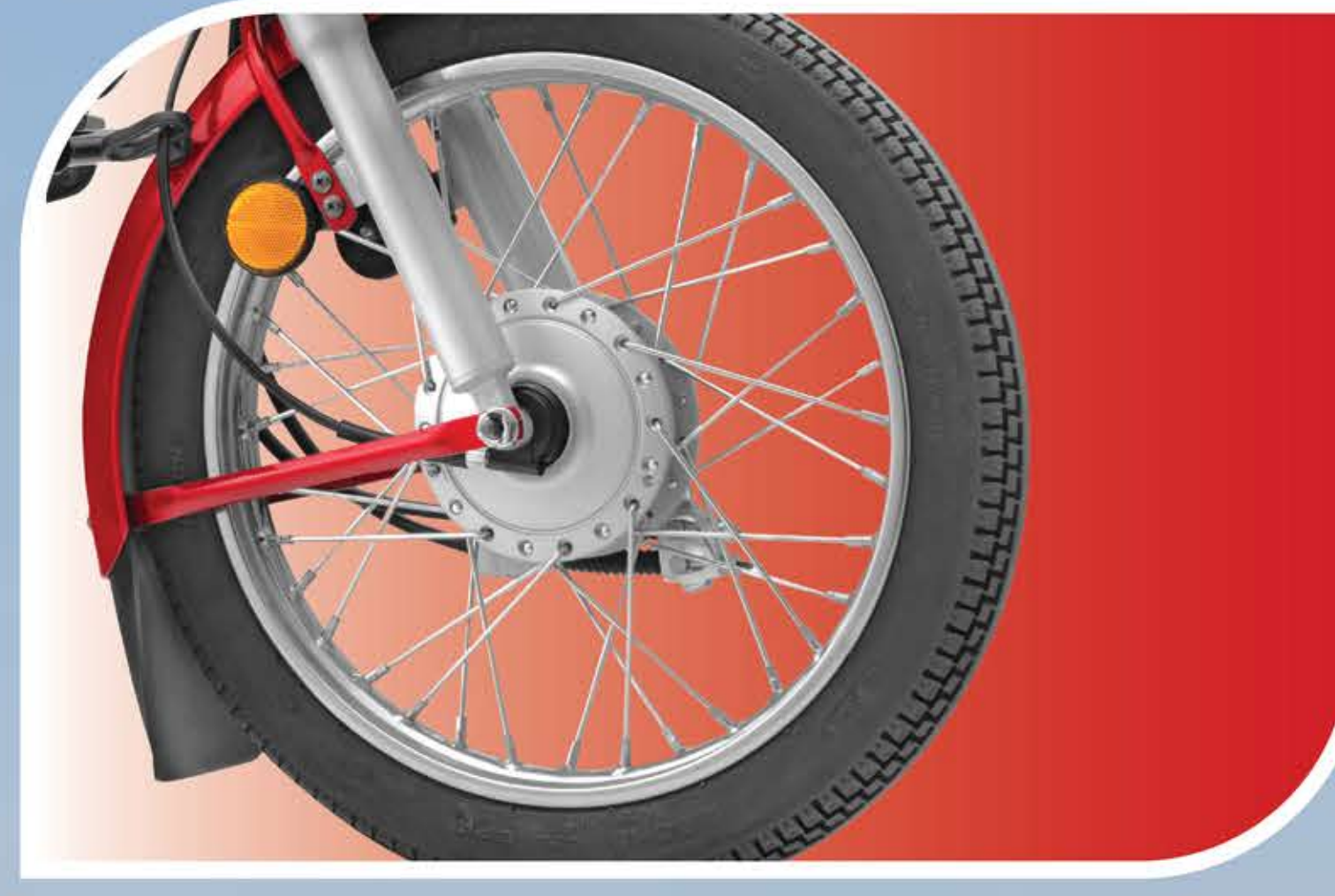
Sync Braking Technology