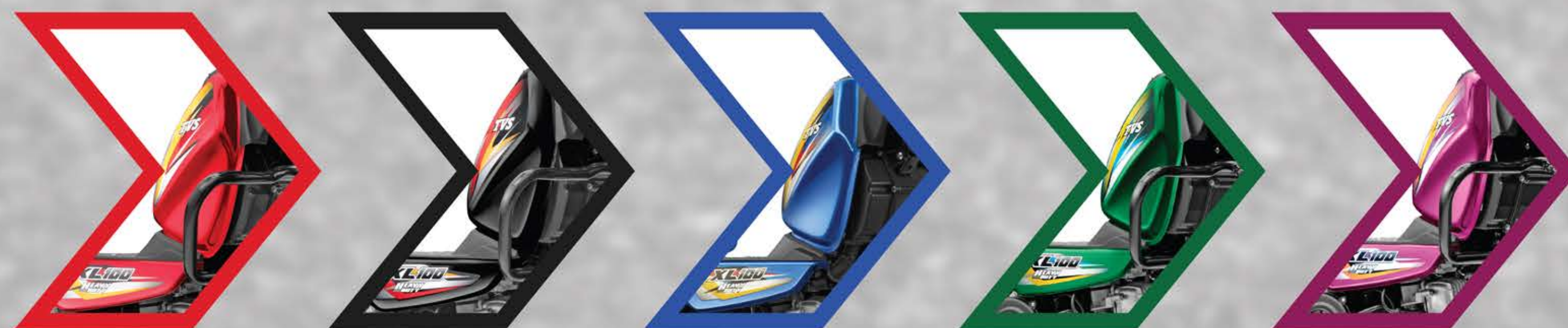
5 Elegant Colours