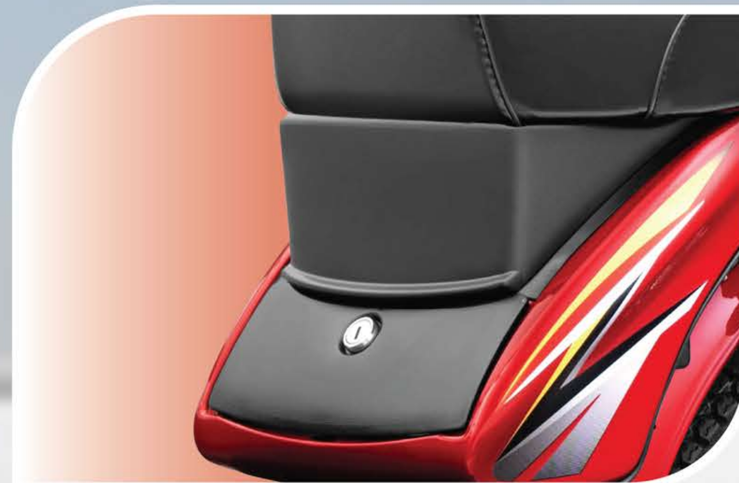
Lockable glove box