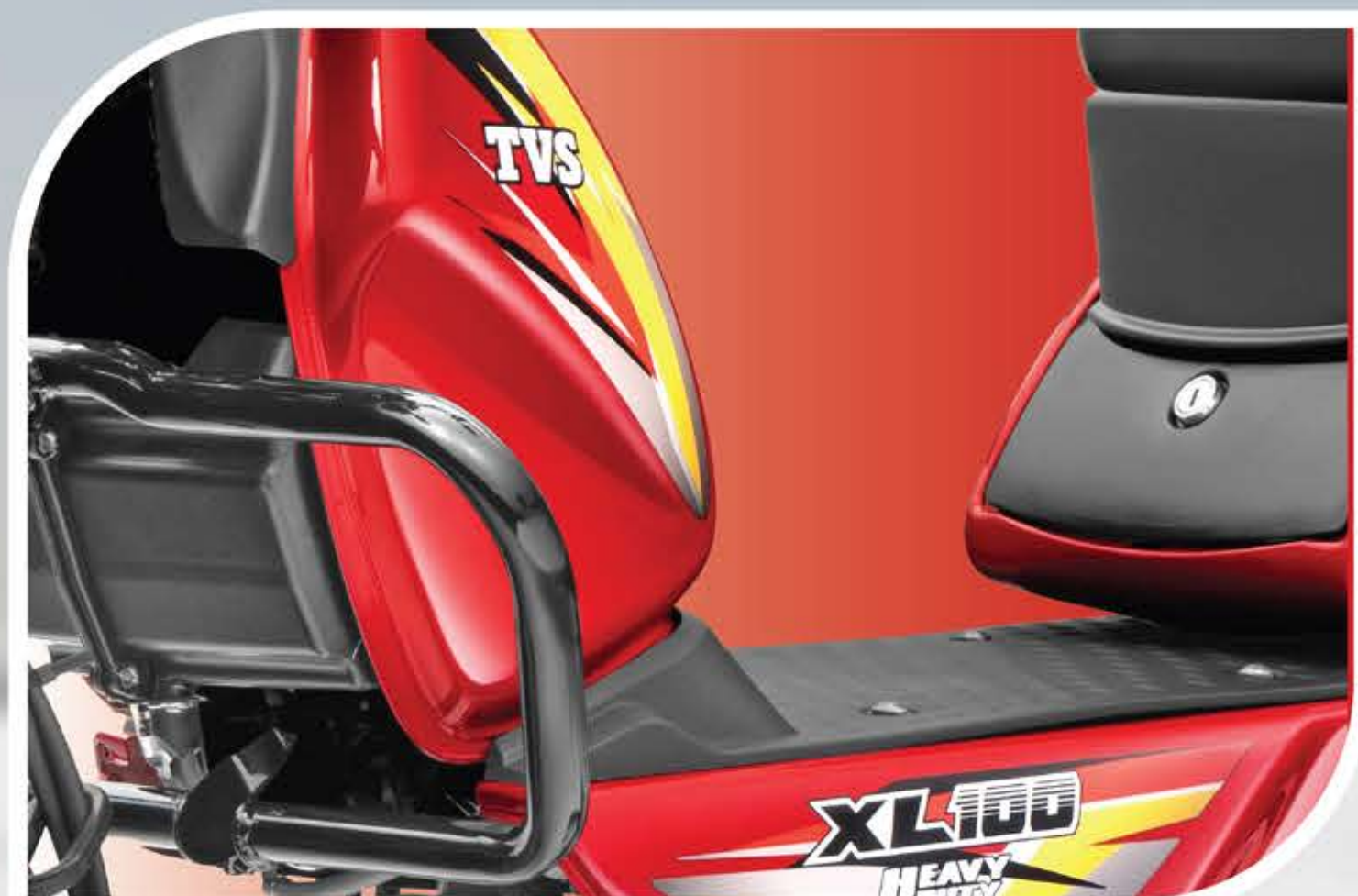
Front loading space