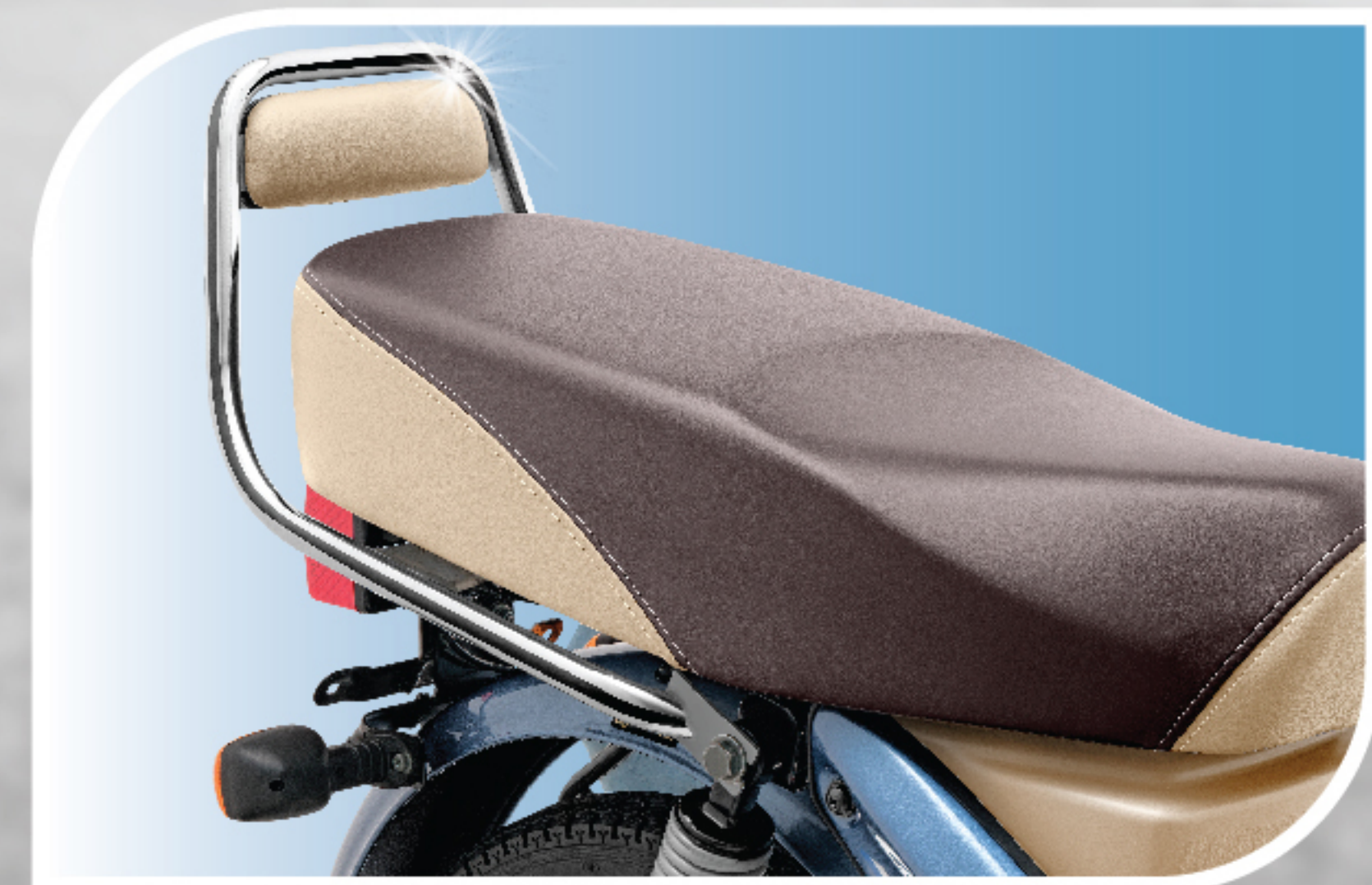
Cushioned Back Rest