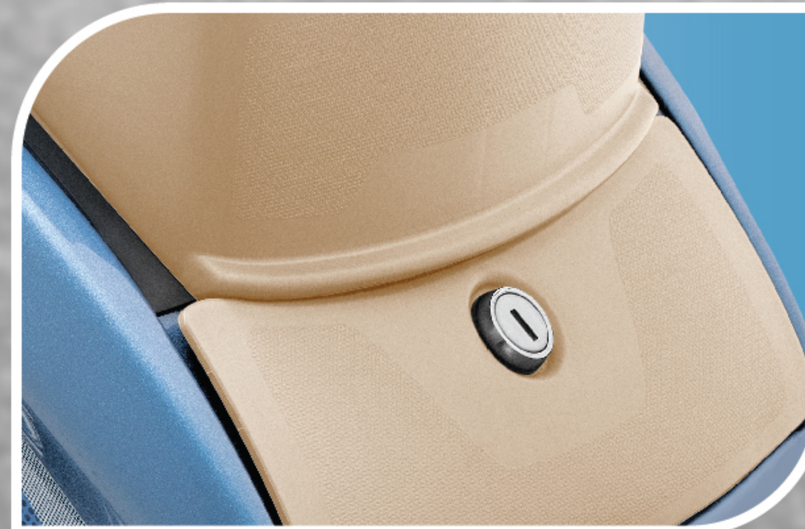
Lockable glove box