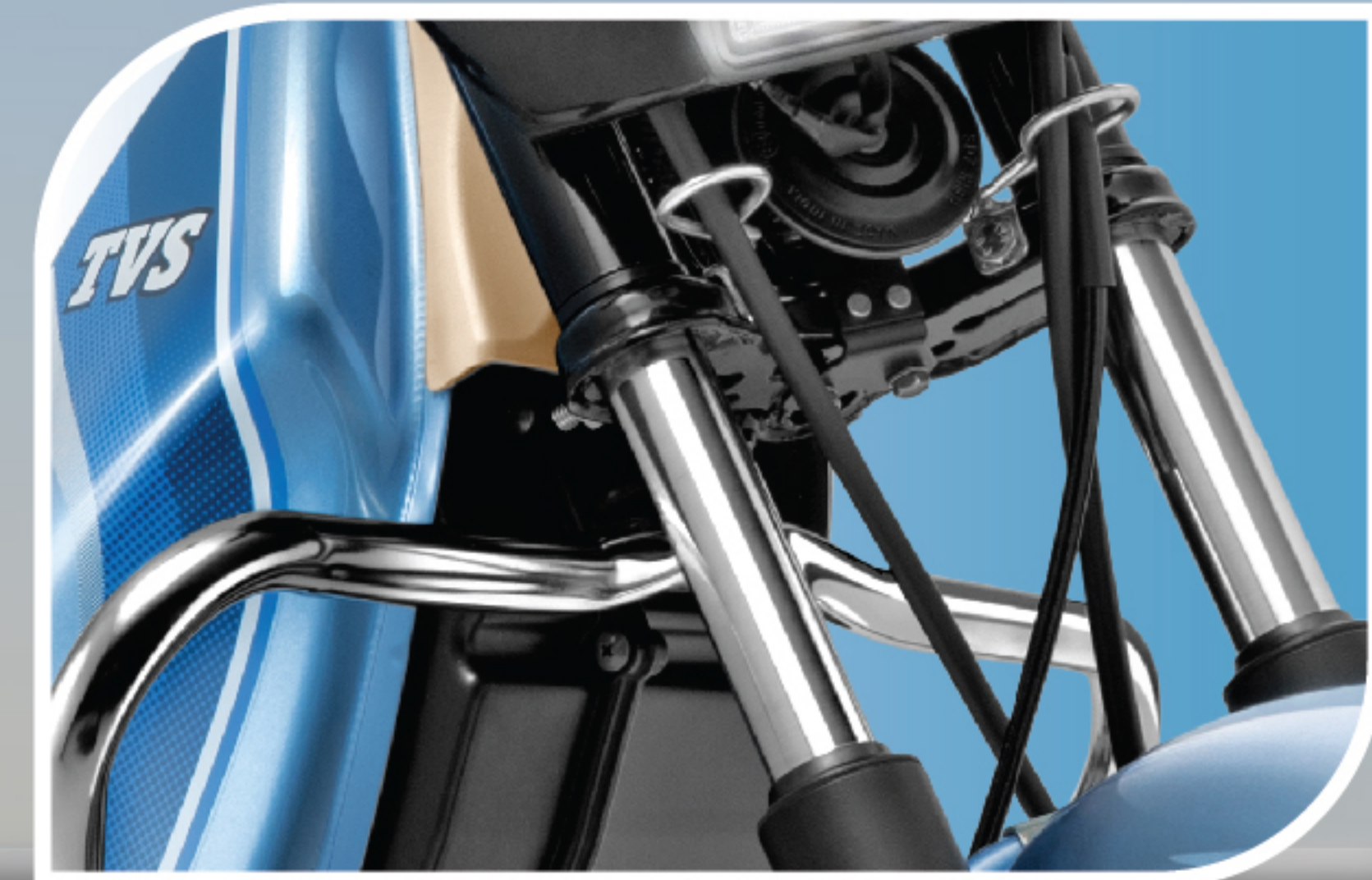
Hydraulic Suspension For Comfortable Ride