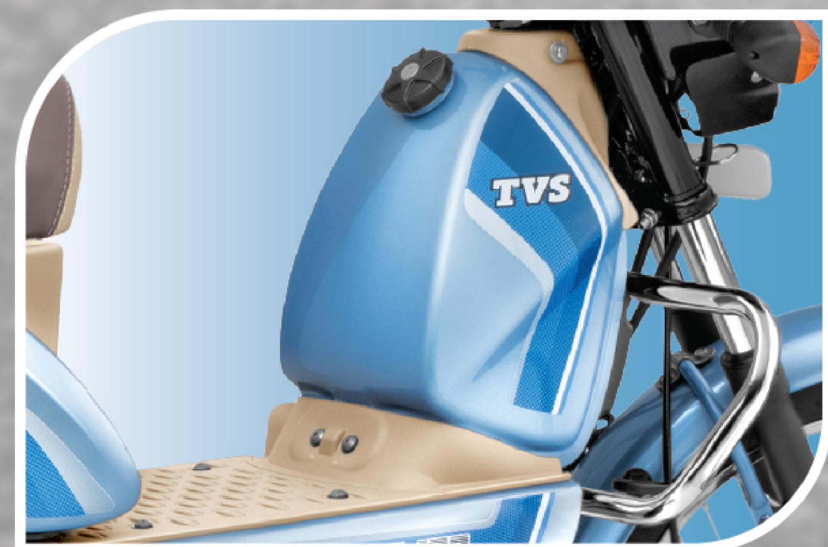
Front loading space