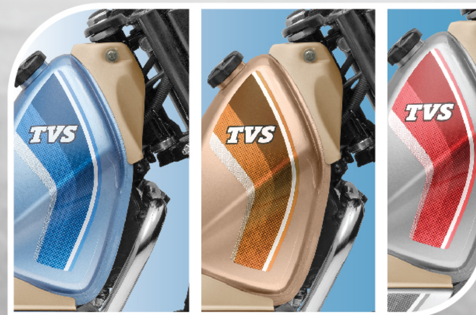
3 Elegant Colours