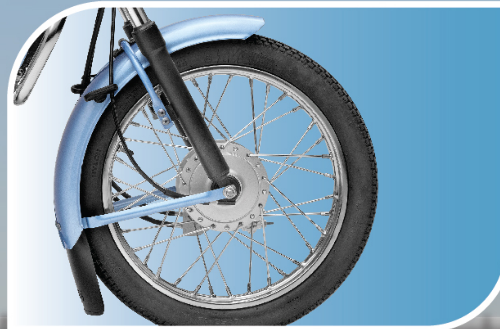
Sync Braking Technology