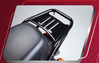
BIG, STRONG CARRIER