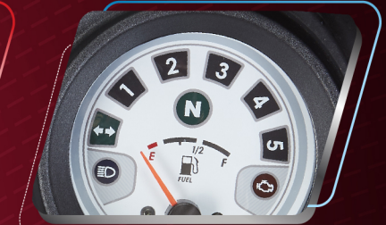
GEAR POSITION INDICATOR