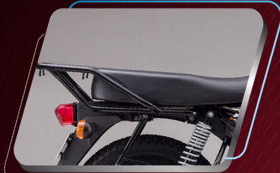
LONG, COMFORTABLE SEAT