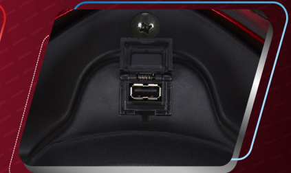
USB MOBILE CHARGER PORT