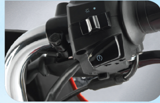
One Touch Electric Start*