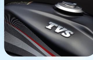
Premium 3D Logo