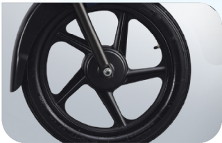
Sporty Alloy Wheels