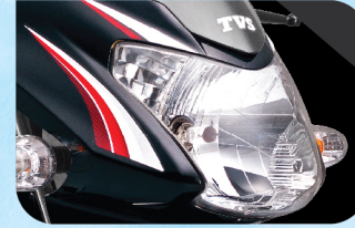
Sporty Headlamp & Tail lamp