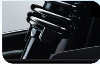
5 Step Adjustable Shock Absorber