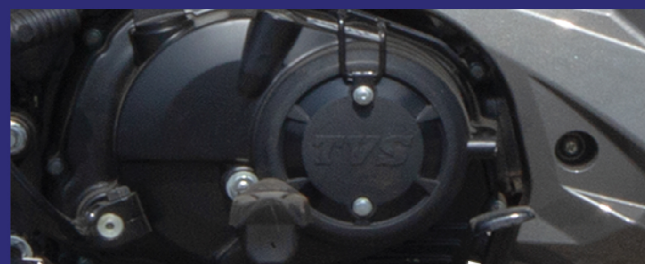
POWERFUL 125 CC ENGINE