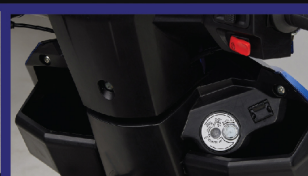
DUAL GLOVE BOX