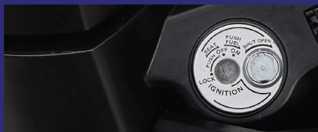
SHUTTER TYPE ALL-IN-ONE LOCK