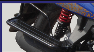
LONG THIRD PILLION FOOT REST