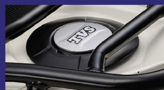
EXTERNAL FUEL FILL