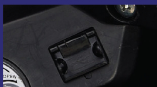
TWIN USB CHARGING PORTS