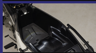
21 LITRE SPACIOUS UTILITY BOX