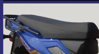
COMFORTABLE LONG SEAT