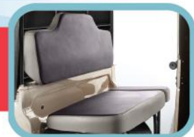
COMFORTABLE LONG DRIVER SEAT