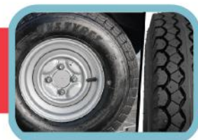
STRONG WHEEL RIM & DEEP TREAD TYRE