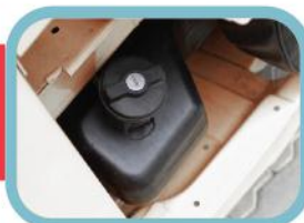
LARGE 15 LITRE PETROL TANK