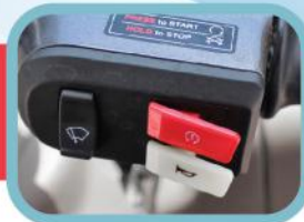
i-TOUCH start SILENT, INSTANT & MAINTENANCE FREE