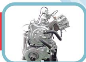
POWERFUL 225CC LIQUID COOLED ENGINE