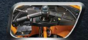
TWIN LOCKABLE GLOVEBOX