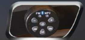
BLUETOOTH MUSIC SYSTEM