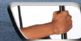
HEAVY DUTY PILLARS