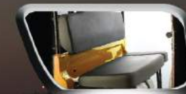
KING SIZE DRIVER SEAT