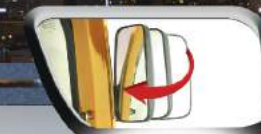
LARGE FOLDABLE MIRROR