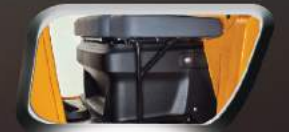
EXTRA LARGE STORAGE BOX