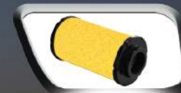
3 STAGE AIR FILTRATION