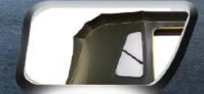
THICKEST IN CLASS CANOPY