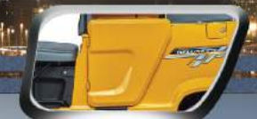
PASSENGER SIDE DOOR