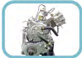
POWERFUL 225CC LIQUID COOLED ENGINE