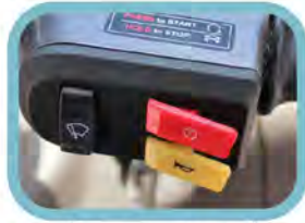
i-TOUCH start SILENT, INSTANT & MAINTENANCE FREE