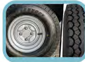
STRONG WHEEL RIM & DEEP TREAD TYRE