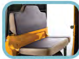
COMFORTABLE LONG DRIVER SEAT