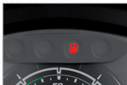
LOW FUEL INDICATOR