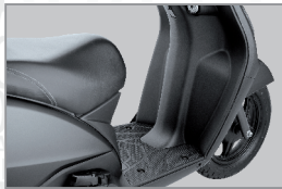
LARGEST FRONT LEG SPACE