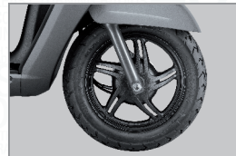
ALLOY WHEELS WITH TUBELESS TYRE