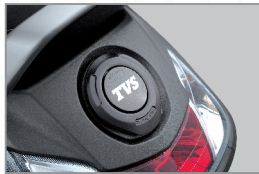
EXTERNAL FUEL FILLING