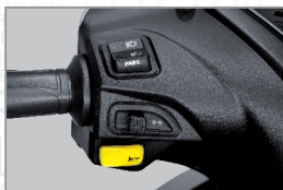
UNIQUE PASS-BY SWITCH