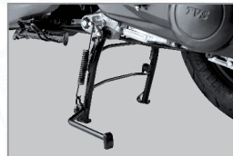
PATENTED E-Z® CENTRE STAND