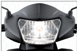
AUTOMATIC HEADLAMP ON (AHO)