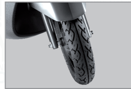
TELESCOPIC FRONT SHOCK ABSORBER