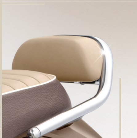
CLASSY CHROME PILLION HANDLE WITH CUSHIONED BACKREST