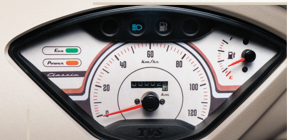
CLASSIC DIAL ART