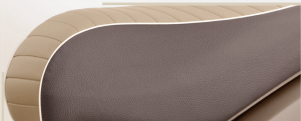
PREMIUM DUAL-TONE SEAT WITH STITCHING