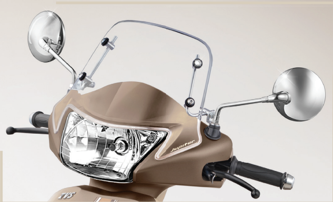
STYLISH WINDSHIELD ELEGANT ROUND-SHAPED FULL CHROME MIRRORS