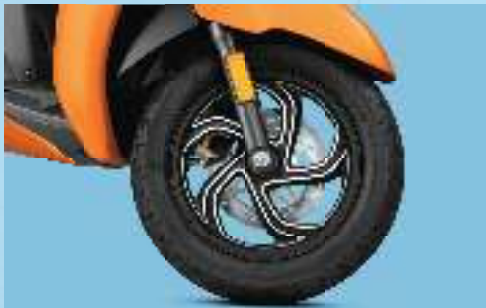
DIAMOND-CUT ALLOY WHEELS