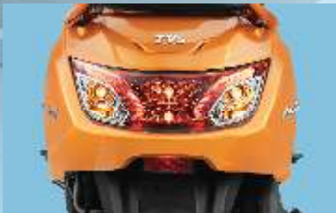
ELEGANT TAIL LAMP