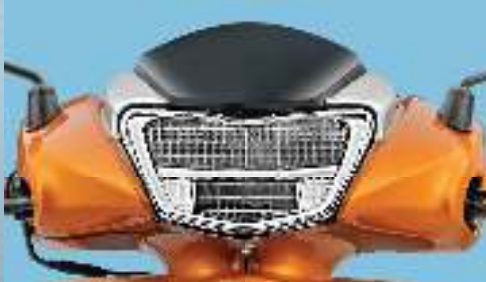
STYLISH LED HEADLAMP WITH VISOR