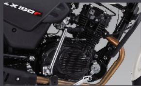
POWERFUL 150CC ENGINE