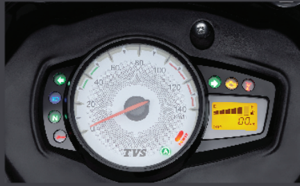
SEMI DIGITAL SPEEDOMETER