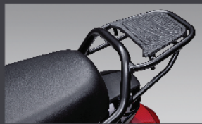
STURDY CARRIER WITH PILLION HANDLE