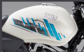
ALL NEW GRAPHICS