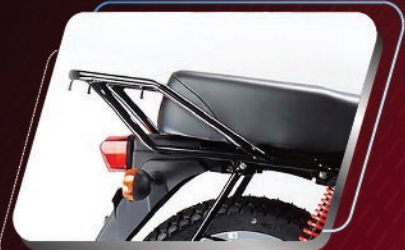
LONG, COMFORTABLE SEAT