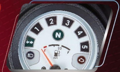
GEAR POSITION INDICATOR