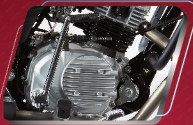
150cc HLX POWER