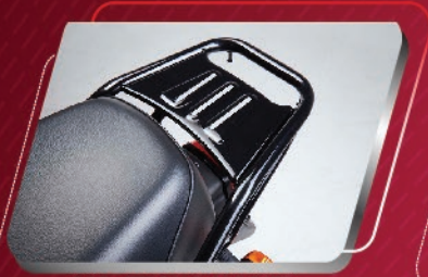
BIG, STRONG CARRIER