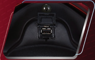
USB MOBILE CHARGER PORT