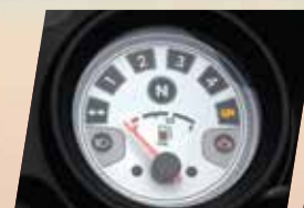
Gear position indicator