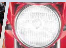
Powerful DC headlamps