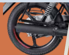
18" rear wheel

Front Brake: Drum 130 mm Rear Brake: Drum 130 mm Front Suspension: Telescopic Oil Damped Rear Suspension: Tough & smooth suspension Transmission: 5-Speed Constant Mesh