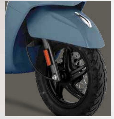
DIAMOND-CUT ALLOY WHEELS