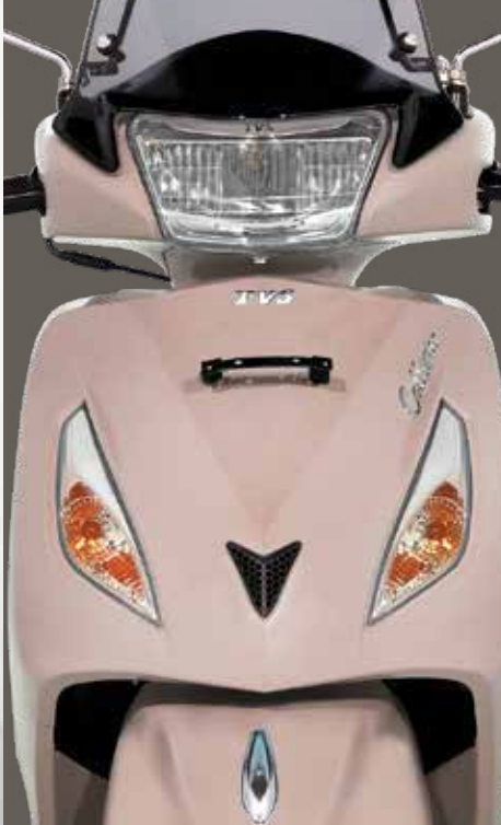
NEW AND REFRESHED FRONT AND SIDE DECAL PANELS