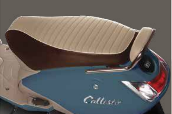
PREMIUM LEATHERETTE SEATS