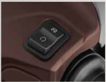
ENGINE KILL SWITCH